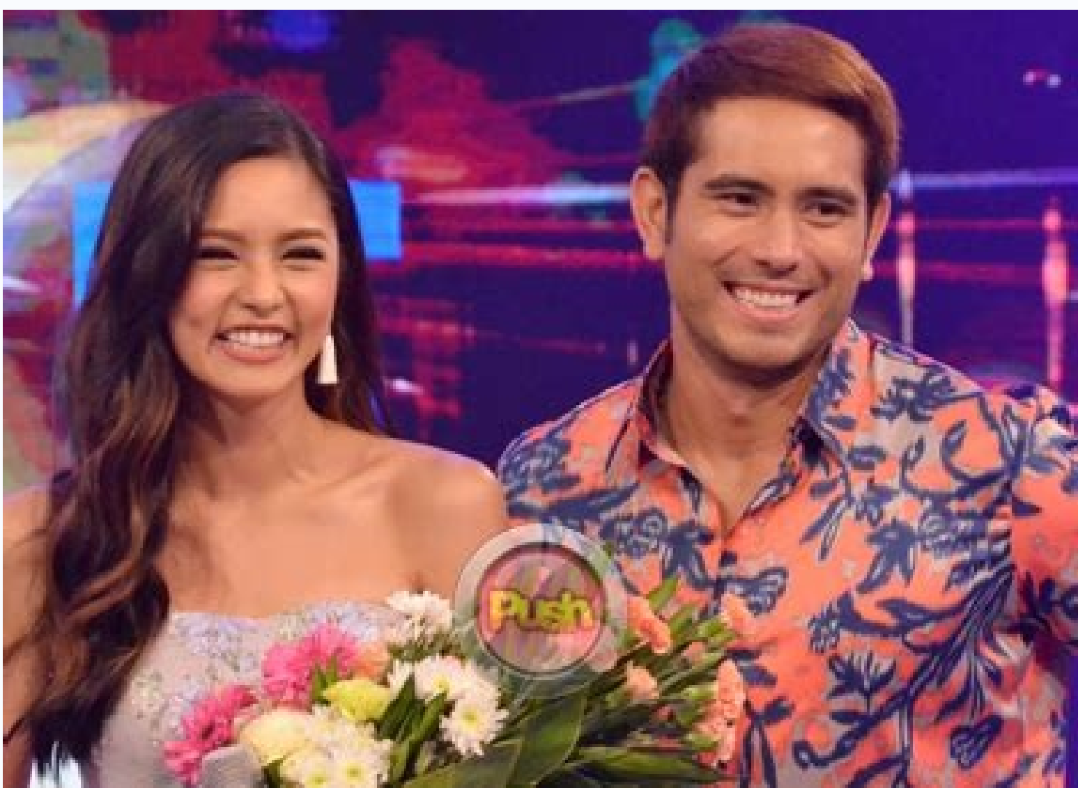
Ikaw lang ang iibigin full cast. Ikaw lang ang iibigin song.